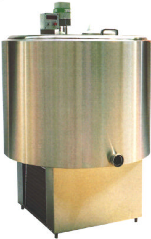
Series I - 100, 200 & 300 litres