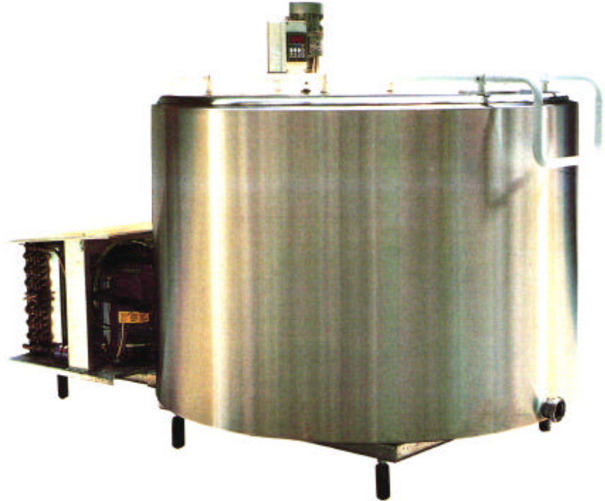
Series II - 400 & 500 litres