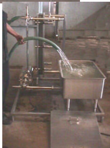
Plate Chiller Unit with Pump & Milk Dump Tank Under Test on Factory Shop Floor