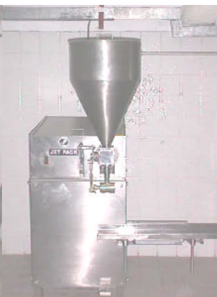
Ghee Filler Unit And Can Reformer Line.