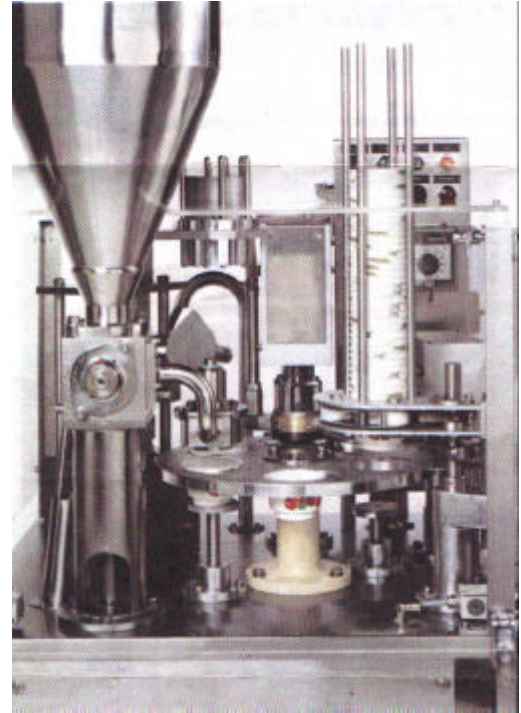
Blow up View