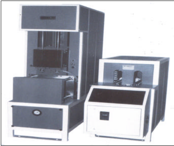
Pet Blowing Machine With Preheating System