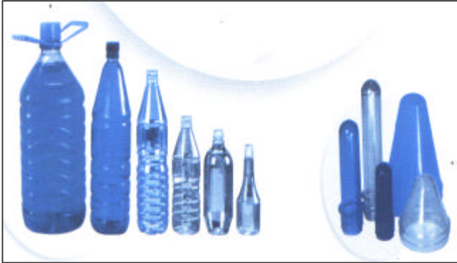
Various Pre-Forms which are Blow Moulded to form bottles .