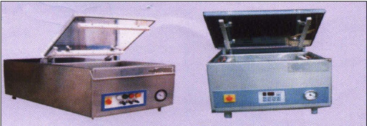
Table Top Models