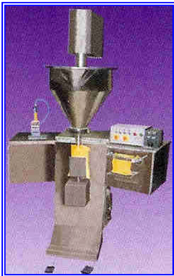
Semi Automatic Fill & Seal Machine with Auger Type Batching Unit. (Commercial Brand)

Rated Output: 20 pouches per min.(Max.) Prod. Volume: 10,000 CC Pouch Size: 240 x 200 Machine Dim: 1200 x 1700 x 2700 Package Style: Central Seal Pillow Pouch Packaging Material: Laminates / Virgin Films. Auger with Weight or Volume control.