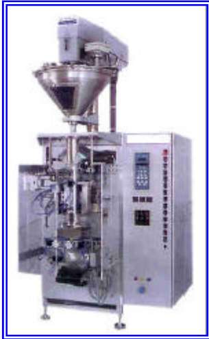
Fully Automatic Form Fill Seal Machine with Auger Type Batching Unit. (Premium Brand)

Rated Output: 20 pouches per min.(Max.) Prod. Volume: 10,000 CC Min Pouch Size: 240 x 200 Max Pouch Size: 370 x 600 Machine Dim: 1650 x 2600 x 3155 Package Style: Central Seal Pillow Pouch Packaging Material: Laminates / Virgin Films. Servo or CBS driven Auger.