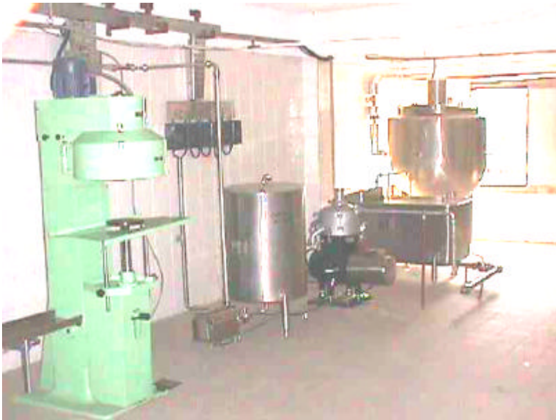
Ghee Vat, Settling Tank, Clarifier & Clarified Ghee Tank