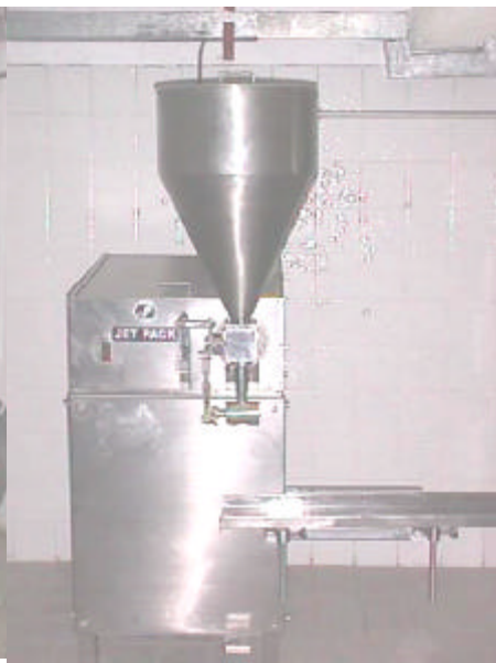
Ghee Filler Unit And Can Reformer Line.